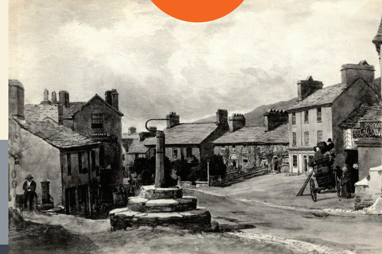
Market Place, Ambleside, Westmorland, photograph by HERBERT BELL of a painting by J Scott, 1848 Showing the building which was demolished to make way for the new civic buildings. © Martin and Jean Norgate: 2016 Armit Library:ALPS15.

Many visitors ask about the fascinating history of the OCG building so we decided to write a guide!