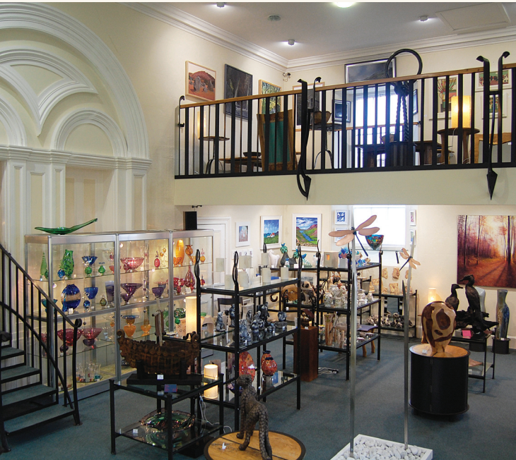
The gallery today