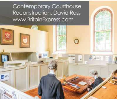
Contemporary Courthouse Reconstruction. David Ross www.BritainExpress.com