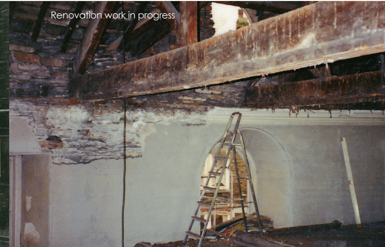
Renovation work in progress